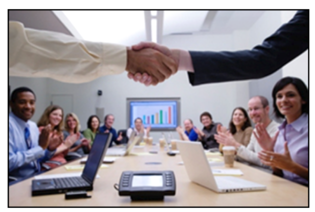
DEAL MANAGEMENT SMART

Selecting the right M&A management solution is critical to leverage each deal opportunity and maximize the anticipated strategic benefits. EMA-Transact will help you meet your objectives.