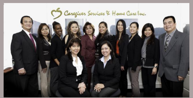
CAREGIVER SERVICES & HOME CARE, INC. TEAM