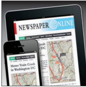
You can now have maps created from scratch in just minutes for your fast-breaking news stories.

Adds impact to your editions on tablet, mobile, print and online.