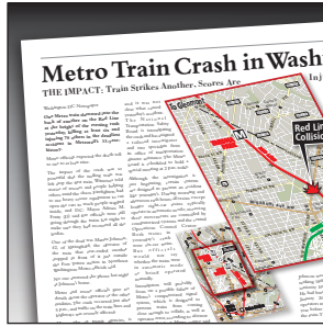
A picture is worth a thousand words, and a content-rich map can communicate the whole story.