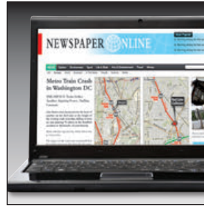
Maps4News works for all your delivery channels – fast, easy, budget-friendly, and royalty-free.

Y ou need eye-catching graphics to engage your readers... and many times there's nothing more relevant than a map... but making map art has traditionally been a production (and sometimes legal) hassle. Now, thanks to Maps4News, this problem is solved!