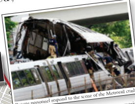
Rescue personnel respond to the scene of the Metrorail crash.

weeks of training. The computerized system should work whether trains are being operated manually or by computer. But even if the signal system failed to stop the train, the operator should have intervened and applied emergency brakes, safety experts familiar with Metro's operations say. The