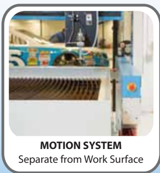
MOTION SYSTEM Separate from Work Surface