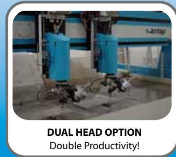
DUAL HEAD OPTION Double Productivity!