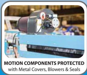
MOTION COMPONENTS PROTECTED with Metal Covers, Blowers & Seals