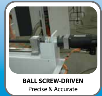
BALL SCREW-DRIVEN Precise & Accurate

WATER WILL CUT VIRTUALLY ANYTHING...INCLUDING COSTS.