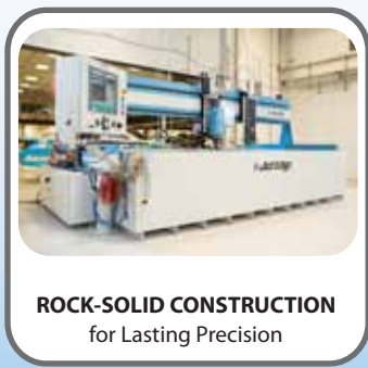
ROCK-SOLID CONSTRUCTION for Lasting Precision

Available in a wide range of sizes, 5'x5' to 24'x13'. Powered by the widest range of pumps in industry!