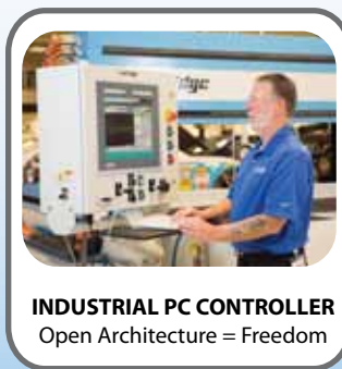
INDUSTRIAL PC CONTROLLER Open Architecture = Freedom