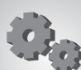
Load of Unnecessary Programs and Services