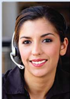
We Know What Works!