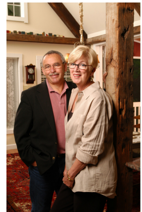
Tony & Jonna Mendez

On a personal note, Jonna says, "I have lost three members of my family over the years, and hospice was there for each one. This family has nothing but the highest respect for the care and dignity that hospice provides. We are honored to speak at One from the Heart."