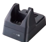
Charging and communication cradle