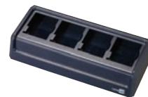
4-slot battery charger