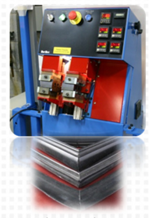
Film Splice Welding