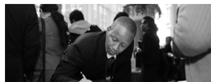
SPOTLIGHT YOUR ORGANIZATION