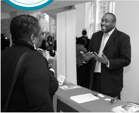
EXHIBIT YOUR COMPANY

As an exhibitor you will have the opportunity to showcase your organization to sponsors, schools, and most importantly the students. You will meet with some of today's brightest students and prospective job seekers where you collect potential candidate resumes and exchange business cards while you network. The HBCU Career Development Marketplace takes the guess work out of looking for qualified candidates and brings them directly to our exhibitors.