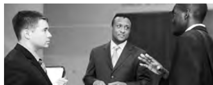
FOSTER PROFESSIONAL DEVELOPMENT

Sponsoring the HBCU Career Development Marketplace is an excellent marketing tool and an investment in the future leaders of America. Increase your brand visibility by placing your company's visuals in front of hundreds of top HBCU graduates, successful HBCU alumni and businesses from around the country.