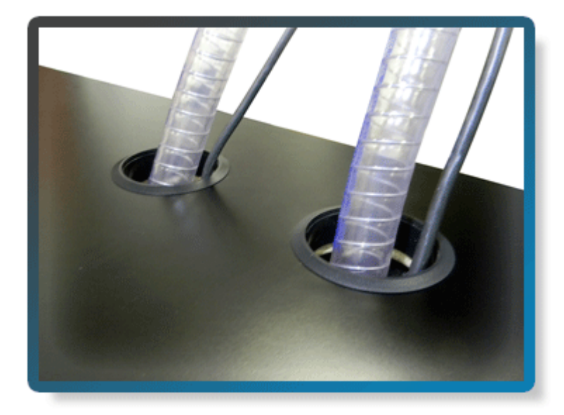
Pipe and cable management