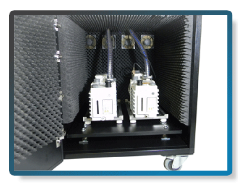
Noise enclosure for vacuum pumps