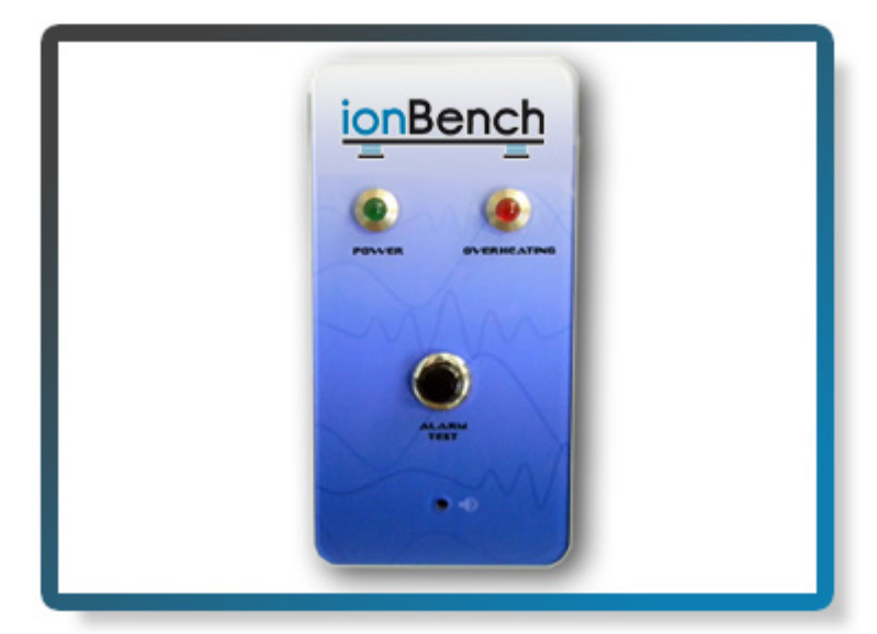
Overheating temperature alarm