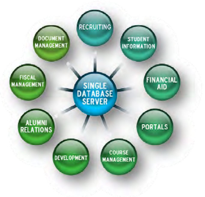
CAMS Enterprise is integrated around a single, shared, secure MS SQL database.

This is possible because the same base technology that powers registration is the basis for all other functions as well. Products designed in this way — as a singular solution rather than an interfaced system— yield a variety of benefits for users: