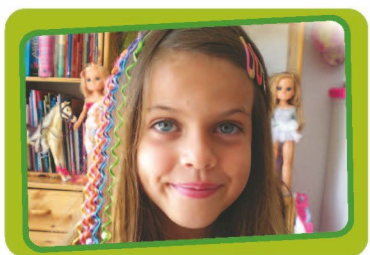
Minerva, 8 years old BRITISH

Wacky Color: Blue & Black Wacky Movie: BFG Wacky Word: Rad Wacky Weather: Snowflakes Wacky Food: Eggs and Bacon Wacky Animal: Reindeer