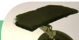
← Rhoades ComfortRide 22" Wide Comfort Seat →

All three GoBoy models are equipped with standard features including your choice of butterfly or bicycle-style handlebars, black mag wheels, white wall tires, disc brake, and 1-speed transmission. Want even more options? The sky is the limit! You can jazz them up with deluxe seats with back rests, 6 or 42-speed gearing*, fenders, cargo box and more.