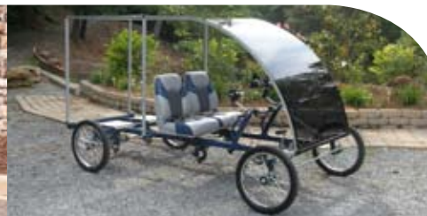
The SportPed Series from Rhoades Car - the greenest ride on planet earth! ← SportPed e-Two Long Frame SportPed e-Four →