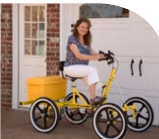
← GoBoy Z1

The GoBoy Series from Rhoades Car - the choice is yours!