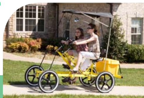
GoBoy X2 →