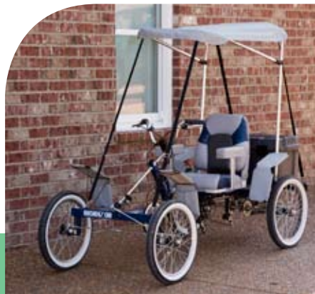
Cycle Car 4W2P Long Frame →