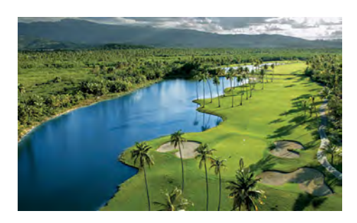
Enjoy exclusive privileges at two worldclass 18-hole championship courses designed by PGA professional Tom Kite.

Extend your trip for a few days and enjoy the warm climate, beautiful sand beaches, and exciting excursions on the island.