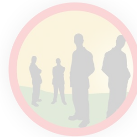
HEALTH INFORMATION EXCHANGE