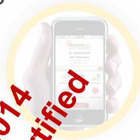
ANYWHERE ANYTIME EHR/PHR