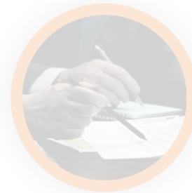
ENTERPRISE REPORTING & ANALYTICS