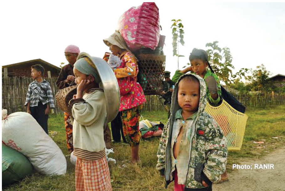
“Families fleeing ongoing fighting in Kachin State, 2013

For these reasons, most of the rapes documented by WLB member organizations over the past three years may be qualified as war crimes.