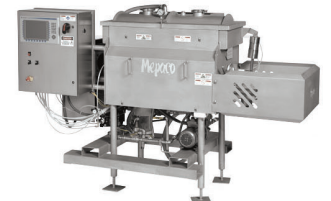
ThermaBlend™ Cookers (Single Agitator)