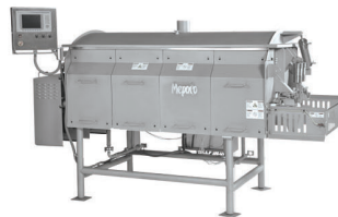
ThermaBlend™ Cookers (Double Agitator)