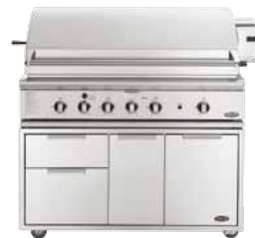
BGB48-BQAR + CAD-48