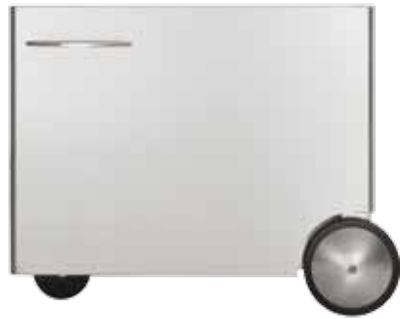
BGB30-CSS, Available for 30" Grills