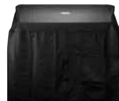
FREESTANDING GRILL COVER