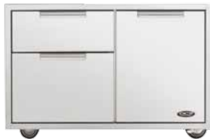
CAD-36, Available for 36" Grills