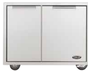
CAD-30 Available for 30" Grills and Liberty Grills