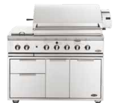
BGB48-BQR + CAD48