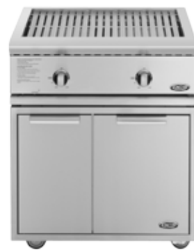
BFG-30BGD + CAD-30