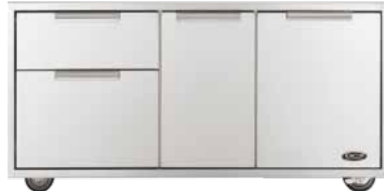
CAD-48, Available for 48" Grills