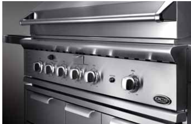
Substantial Quality Durable

UNITING MODERN SOPHISTICATION & CULINARY PERFORMANCE WITH THE DURABILITY OF PROFESSIONAL DESIGN TO DELIVER THE INGREDIENTS OF COMMERCIAL REFINEMENT.