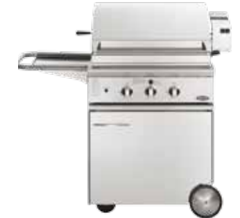
BGB30-BQR + BGB30-CSS