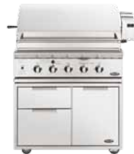
BGB36-BQAR + CAD-36