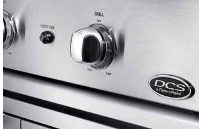
Authentic Commercial Professional