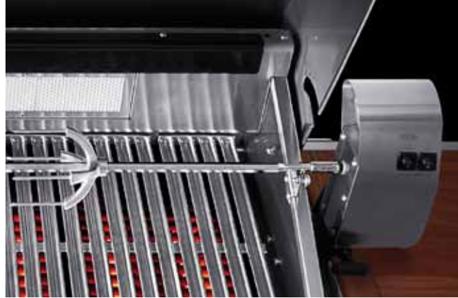
Functional Culinary Reliable