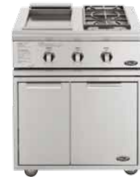
BFG-30BGD + CAD-30