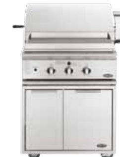
BGB30-BQR + CAD-30