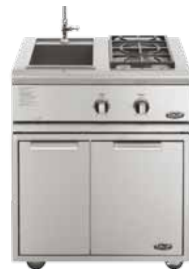
BFG-30BS + CAD-30