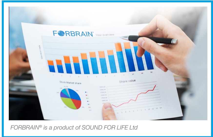
FORBRAIN® is a product of SOUND FOR LIFE Ltd

We strongly believe at SOUND FOR LIFE that cognitive abilities can be improved throughout life with regular practice of multiple exercises. Learning and communication can improve.