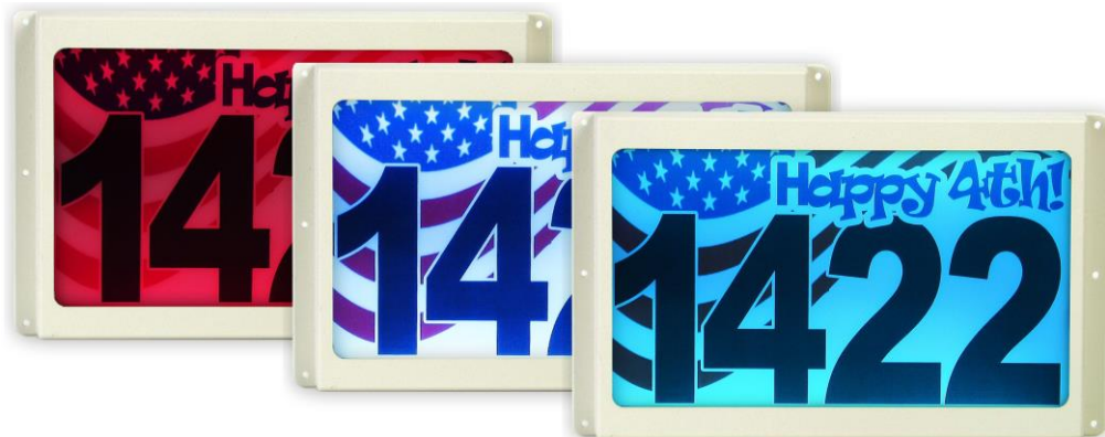
Example 3: MagicSign™ with custom SignSheet™ of Happy 4 th , street address “1422”