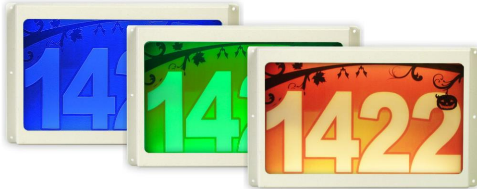
Example 1: MagicSign™ with custom SignSheet™ of Halloween , street address “1422”