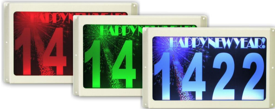
Example 2: MagicSign™ with custom SignSheet™ of Happy New Year , street address “1422”