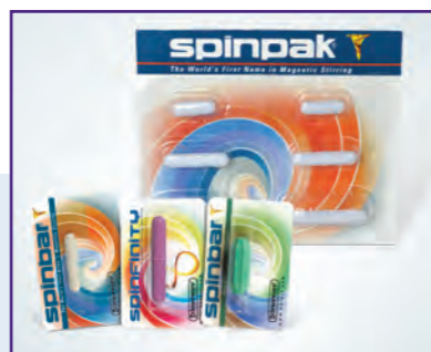
Spinbar® Magnetic Stirring Bars

This facility is dedicated to the compression molding of Teflon® to create a proprietary product line.