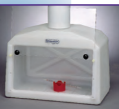
and Fume Hoods

Polypropylene sinks and fume hoods are for use in environments where metals will corrode, such as metal finishing.