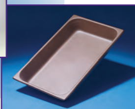
The tray is Teflon® Coated