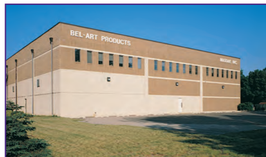
Bel-Art Products in Wayne, NJ

With manufacturing facilities in New Jersey, Maryland, Missouri and Pennsylvania Bel-Art Products has several subsidiaries, each with a core competency. In addition to our proprietary products, we also do custom manufacturing. "If you can draw it, we can probably make it at one or more of our locations."