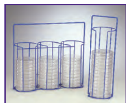
Shown here are steel racks with epoxy coating.

Wayne, New Jersey The technology at this location is focused on Release and Corrosion-Resistant Coatings, for example Teflon® non-stick coatings and Decorative Coatings, available in a rainbow of colors. Products can be coated in your choice of colors and materials.