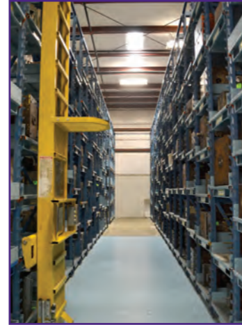
"Library" of Molds

Tour our facility and see the production processes.