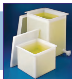
Rotational molding is ideal for creating tanks.

Polypropylene sinks and fume hoods are for use in environments where metals will corrode, such as metal finishing.