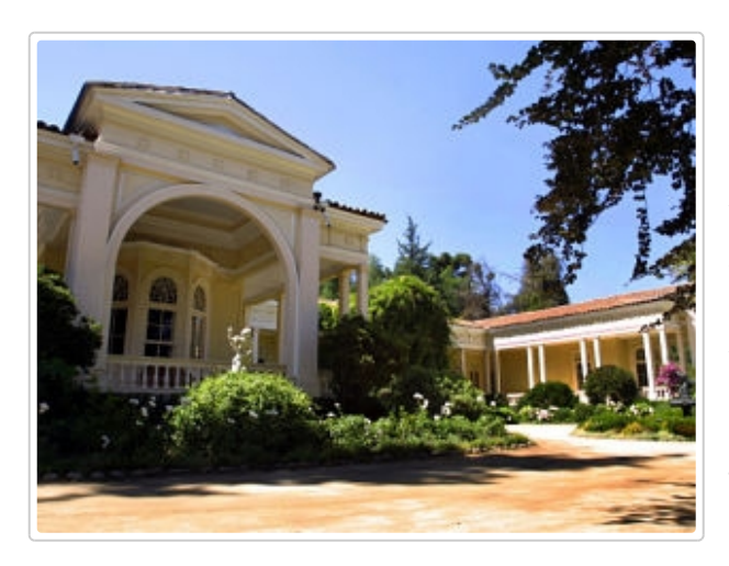
Day 2 CONCHA Y TORO WINERY TOUR

After a hearty breakfast, enjoy a full-day private excursion to Concha y Toro Winery