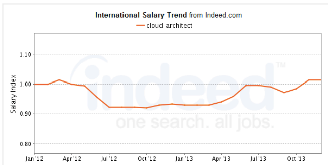
Average Salary of Jobs with Related Titles