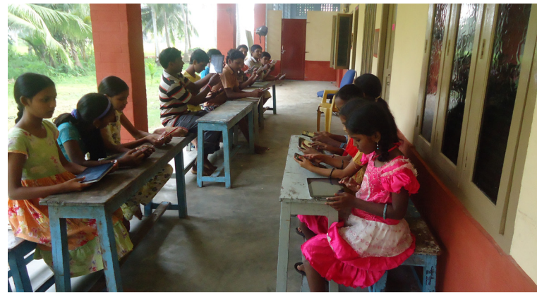
Giff1 Tablets being used by students at Miracle Children’s Home

with a loved one battling illness, bridge the digital divide between wealthy and impoverished communities, supplement childhood education and development, and, yes, offer a little bit of an escape from the trials of reality.”