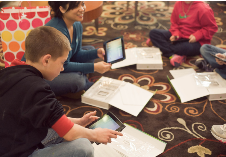
A Giff1 donation at Ronald McDonald House Cincinnati

“We feel very fortunate to have such a great group of organizations behind us to get the program started,” she said. “When most people think of tablets, they just think of it as an entertainment device. We see it as a tool to connect families