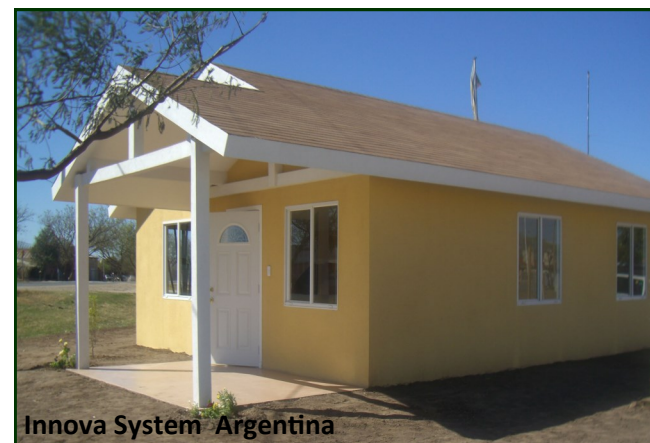
Innova System Argentina

We have one of the most modern, automated SIP's manufacturing facilities in the world. We know what it takes to create structures that can withstand the elements including hurricanes and earthquakes. Our structures are designed to perform under pressure, without sacrificing energy efficiency, comfort or ease of construction. Since all Innova building components are engineered and manufactured in our factory to exacting specifications, the Innova fast-track construction system not only reduces waste, but greatly accelerates the building schedule while reducing labor requirements for construction.