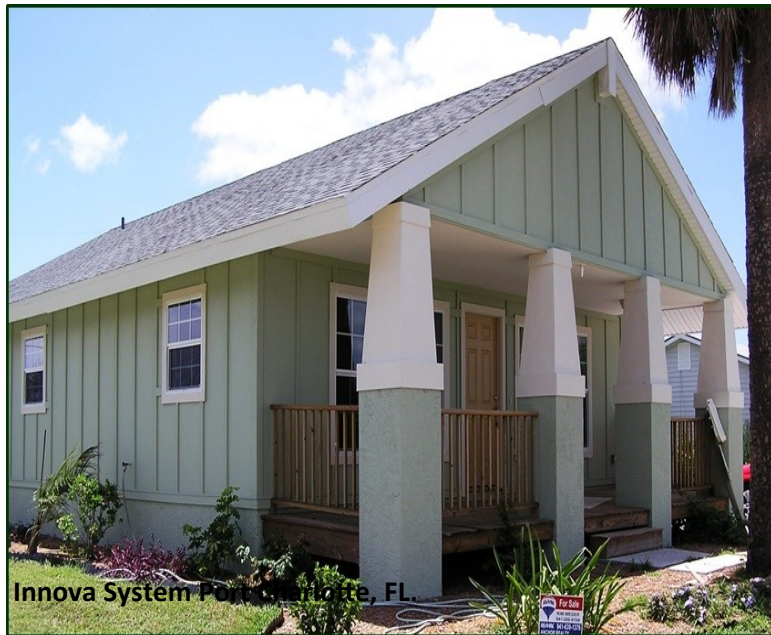
Innova System Port Charlotte, FL.