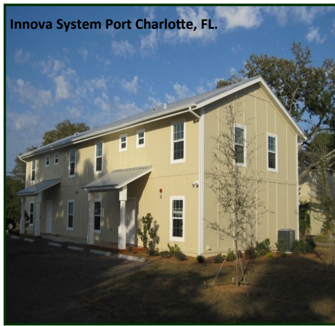
Innova System Port Charlotte, FL.

Today's home buyers are investing in energy-efficient homes that are green, strong and affordable. With all building envelope components engineered and built in our factory to exacting specifications, the Innova fast-track construction system accelerates the building schedule while using less labor which saves the building Owner time and money!