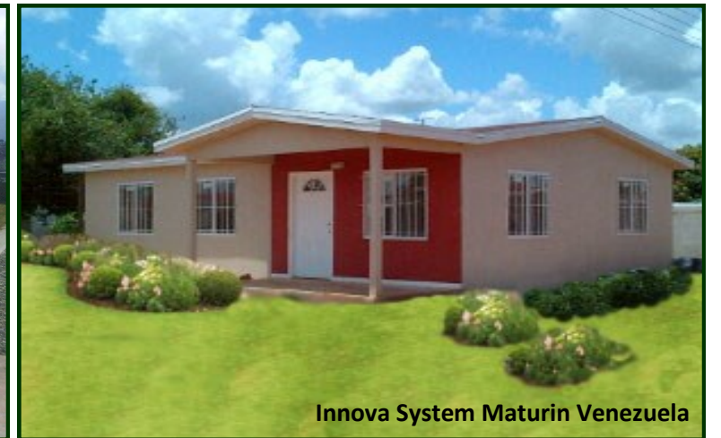
Innova System Maturin Venezuela