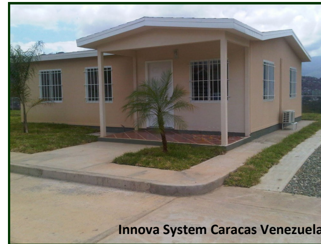
Innova System Caracas Venezuela

A home or commercial building constructed with the Innova building envelope will cost much less to maintain. Our building materials are Eco-Friendly "Green Building" building materials. Your Innova building kit can qualify for Leed, Green Building and PATH certifications. In addition to all of these benefits, your Innova Building will continue to save you money long after your purchase as one of the most dramatic cost savings are realized in energy use. Because of its extraordinary insulation ratings, innovative air-tight design and efficient engineering, a building constructed with the Innova building envelope will use 30 to 70 percent less electrical consumption over the useful life of the building. This is a substantial savings over 30, 40, 50 or more years of reduced electrical consumption and energy savings.