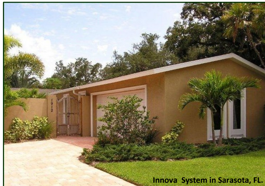
Innova System in Sarasota, FL.