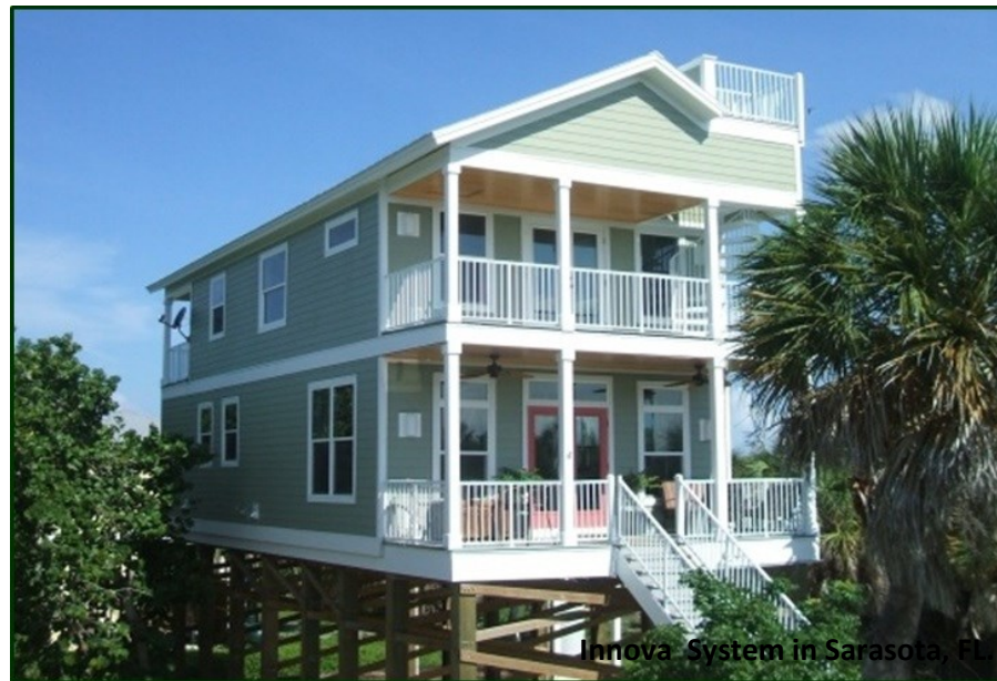
Innova System in Sarasota, FL.

Whether you build one home or 1000, using the Innova Panelized construction system will not only cut the cost of construction, but it will also dramatically lower the operating and maintenance costs over the useful life of the building.