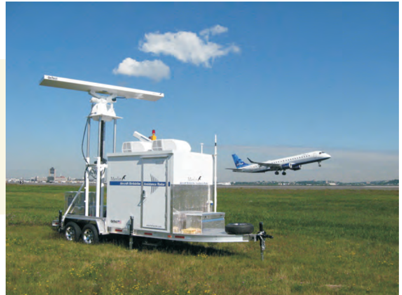
TOP: MERLIN SS200d mobile system operating at Boston Logan International Airport, Boston, Massachusetts USA