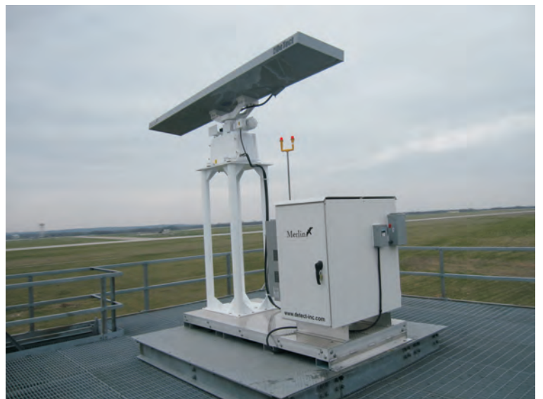
BOTTOM: MERLIN systems are also available in fixed, fully self-contained skid package units (MERLIN Ss200d HSR sensor installation at US Air Force Whiteman AFB, Missouri USA.

specifications subject to change without notice