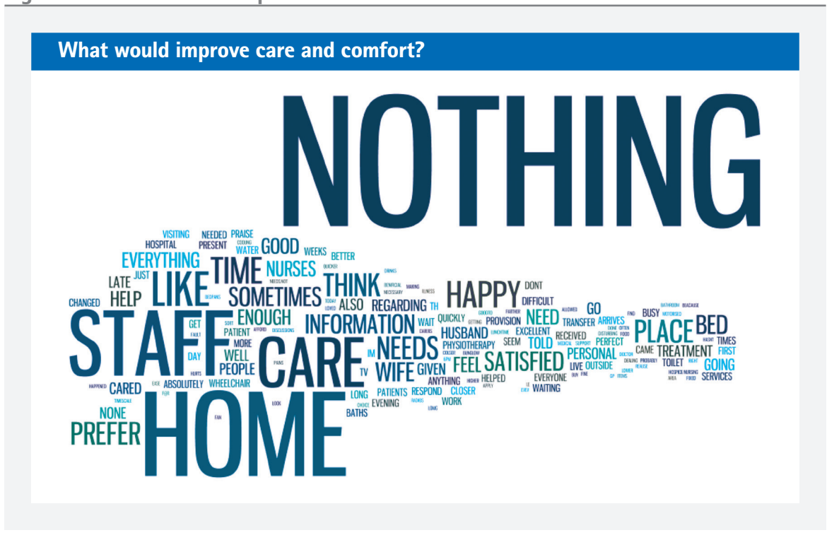
Figure 9: Word cloud example