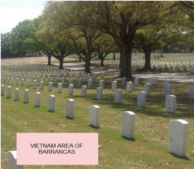
VIETNAM AREA OF BARRANCAS

Most of the Fallen in Vietnam buried at Barrancas are from Northwest Florida. A detail list with a link to the Vietnam Wall Database for each of the fallen follows.