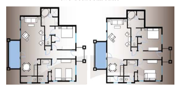
three bedroom suite