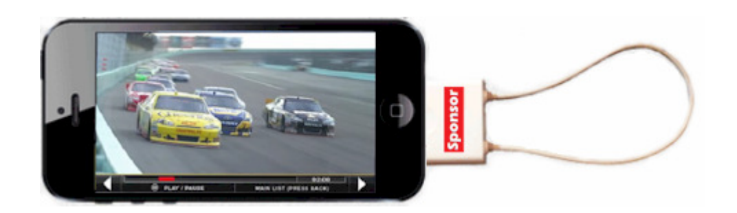
3. Purchase Receiver