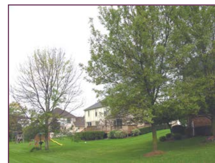
Healthy ash tree protected with insecticide treatments growing next to an untreated Ash Tree killed by EAB.

To be a good candidate for treatment, the Ash Tree must have at least 50% of its crown, meet minimum health standards and be able to absorb treatment.