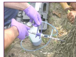
Trunk injection is the most effective treatment for Emerald Ash Borer. The insecticide provides protection for two years.