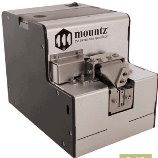
Table Top Screw Presenter