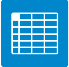
Level 3 & 4 NCI Reporting

Oncology trials: managed! Tracking and managing oncology trials can be a complex and time consuming process. With clinical and financial results on the line, it is more important than ever to have the right tools to ensure timely and accurate oncology trial management. Clinical Conductor CTMS takes the work and worry out of managing oncology trails by ensuring protocol accuracy, implementing strong communication and centralizing billing activities.