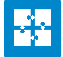
Complex Protocol Management

Visit www.clinicalconductor.com for more information!