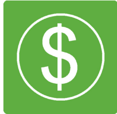
Oncology Billing Functionality