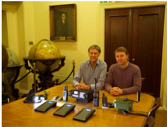
Left: Codan 2110 Manpack in use during the expedition