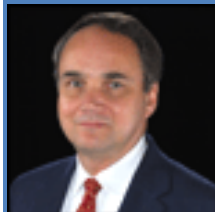
Commissioner District 2 Jeff Rader