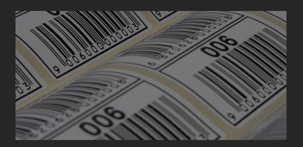
Custom Labeling & Preloaded Content Cactus can produce any of our products with custom labeling or preloaded content based on customer provided artwork and data.

Cactus Technologies understands many OEMs require additional features or functionality in their flash storage devices than what is available off the shelf. With that in mind, we offer customization of our products to meet your specific requirements.