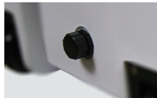
¾" DRAIN PLUG