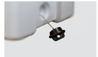
2" DRAIN PLUG