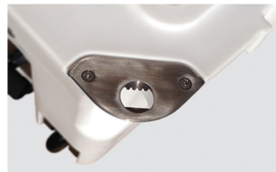
BOTTLE OPENER LOCK POINTS