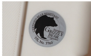
CERTIFIED BEAR RESISTANT