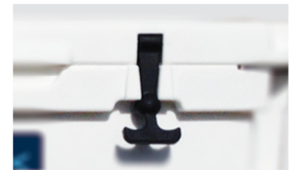
POSILATCH™ RUBBER LATCH