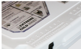
CUTTING BOARD LID