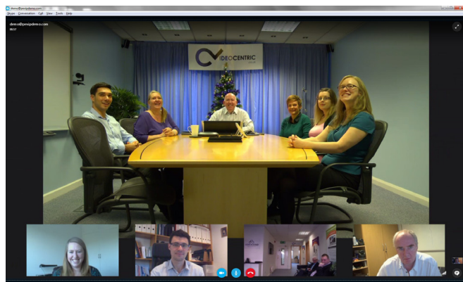
Using VideoCloud 365 to connect Skype with Cisco, Microsoft Lync & Polycom systems