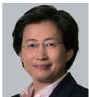
Lisa Su President & CEO, AMD