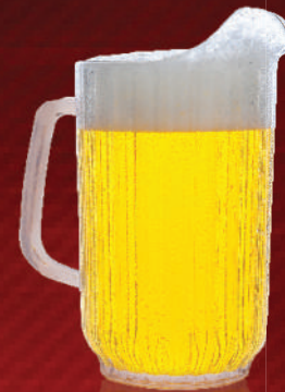
MONDAY PITCHER NIGHT