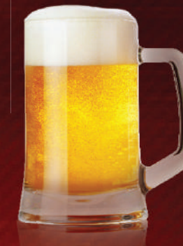
WEDNESDAY MACHO MUG NIGHT