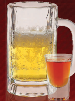
TUESDAY ROOTBEER BARREL NIGHT