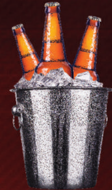
THURSDAY BUCKET NIGHT