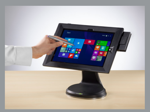
Detatched Stylus for Capturing Signatures