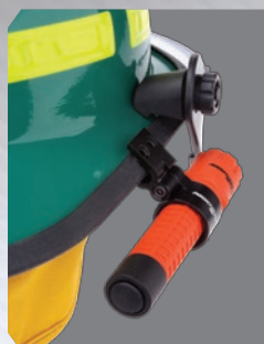
Multi-angle helmet mount