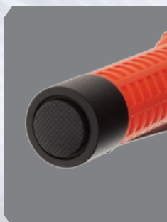
Large textured tail-switch