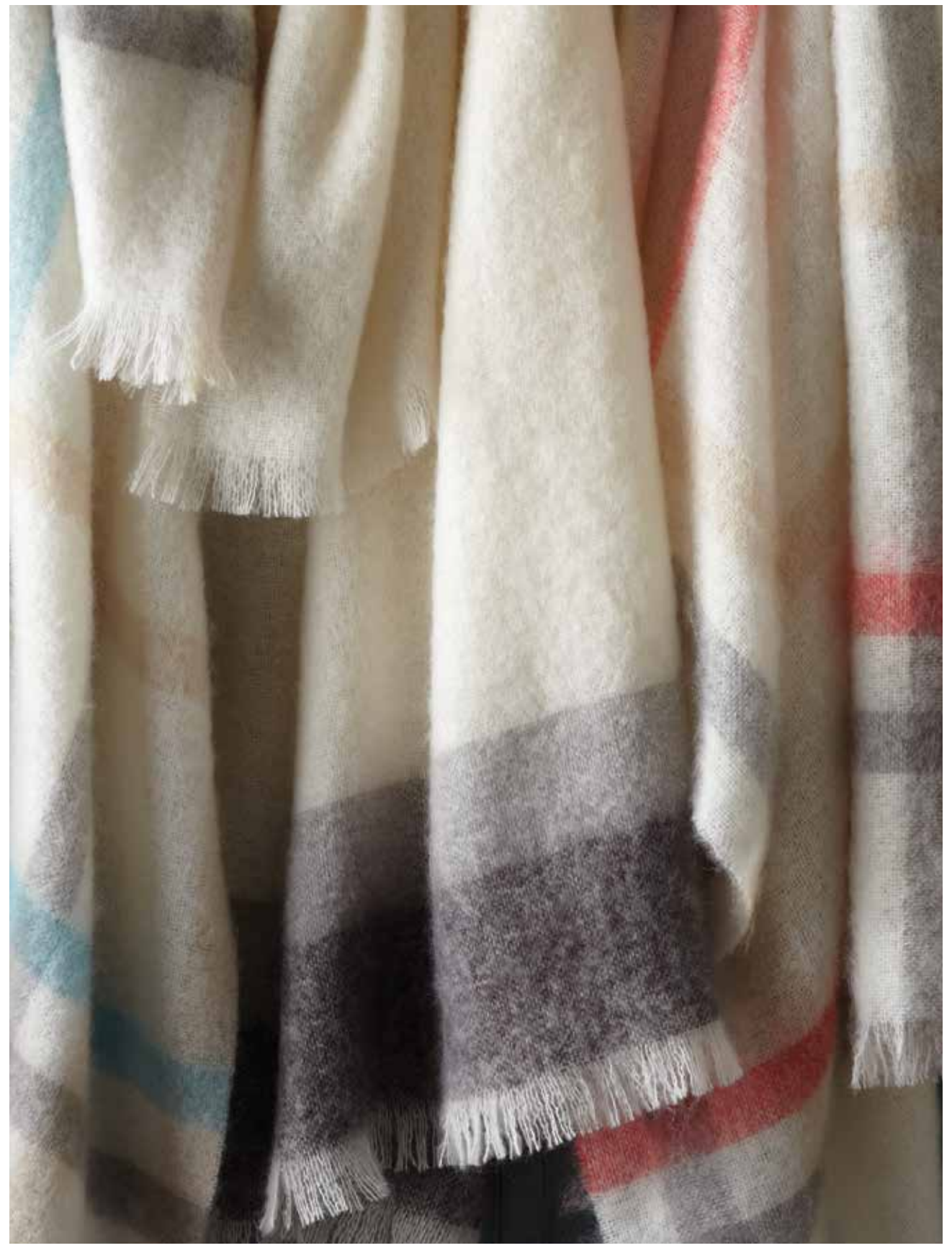
(From left to right) CAPE TOWN THROW Aqua-Plaid, Pearl-Grey Stripe, Coral-Plaid. 70% mohair/30% wool. South Africa. Throw CPS/CPP-TH $260. See peacockalley.com for more