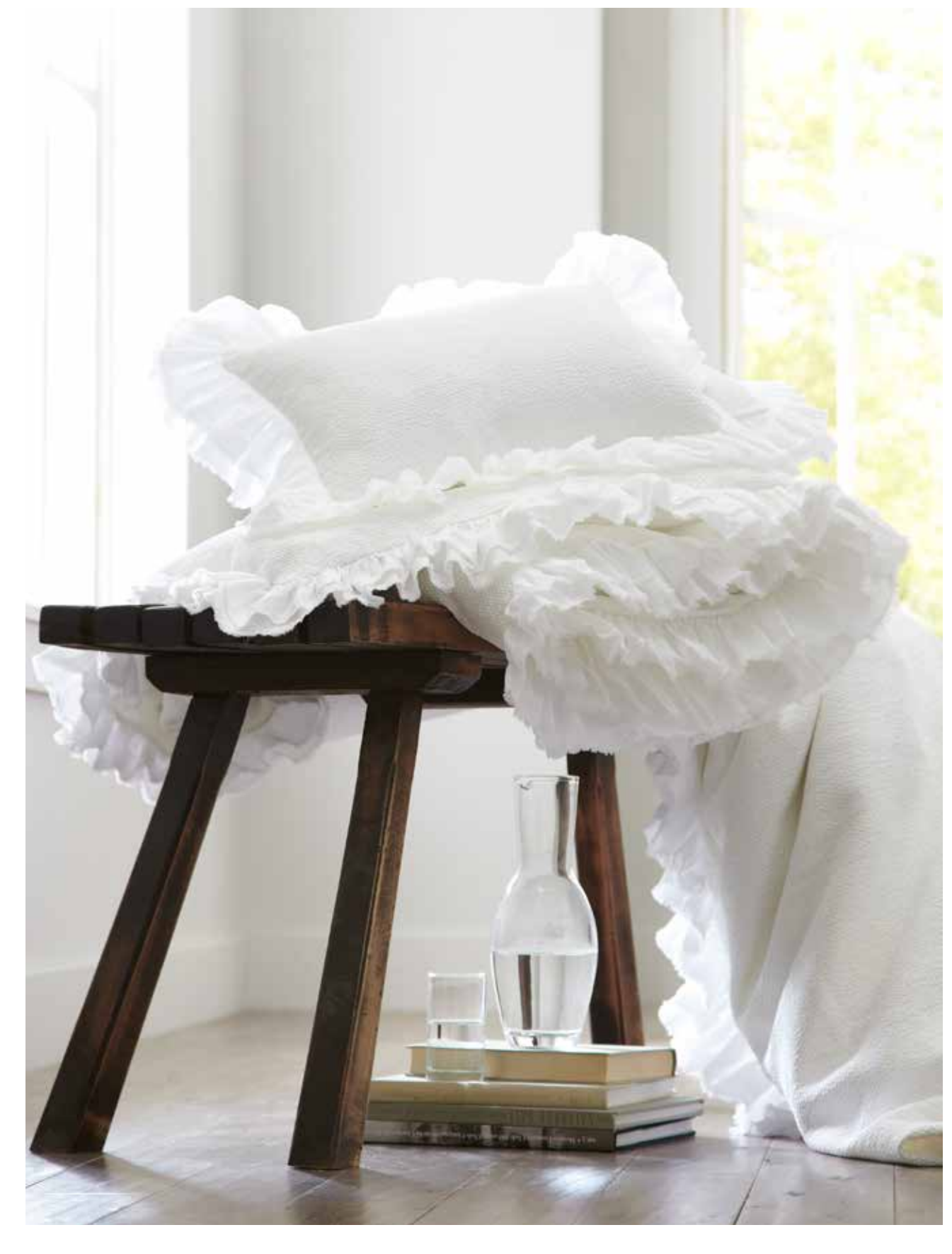
PENELOPE DUVET COVER & PILLOW White. 100% Egyptian cotton. Portugal. Duvet PEN-O Twin-King $460-$575. Pillow PEN-3 Boudoir $100. See peacockalley.com for more