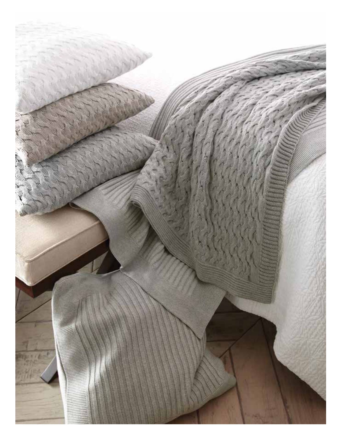
(Top to bottom, from left to right) MAJORCA PILLOW & THROW White, Linen-color, Flint. 100% cotton. Portugal. Pillow MAJ-SDP Square $190. Throw MAJ-TH $265. CAPTIVA PILLOW & THROW Flint. 100% cotton. Portugal. Pillow CAP-SDP Square $112. Throw CAP-TH $170. See peacockalley.com for more