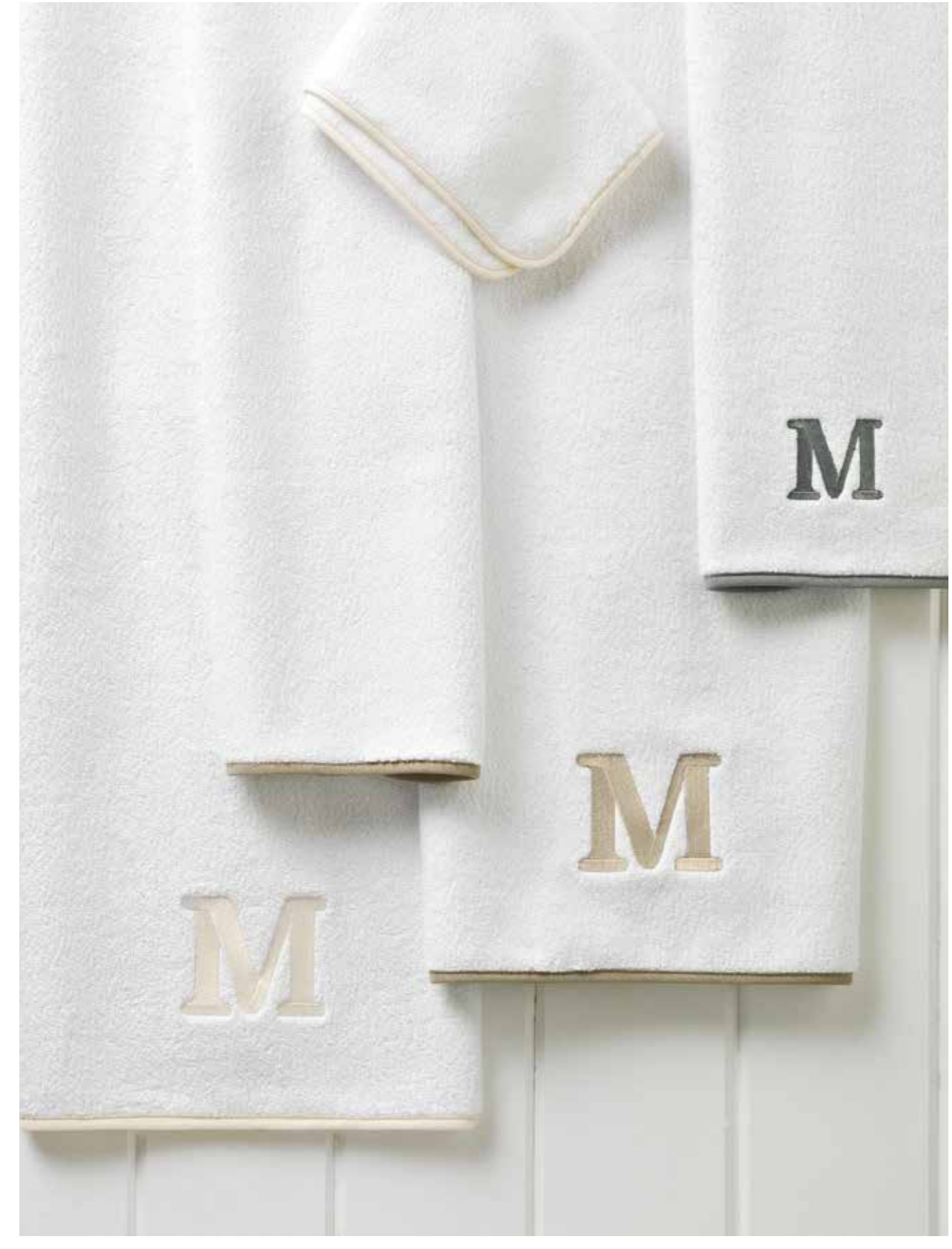
(Opposite page, from left to right) ALYSSA SHOWER CURTAIN White. 100% cotton. Portugal. Shower Curtain ALY-SC $135. TIFFANY BATH RUG White. 100% long-staple cotton. Portugal. Small Bath Rug TIF-SM $85. (Above, from left to right) METRO TOWELS White with Pearl, Linen-color, Flint trim. 100% long-staple cotton. Made in the USA of Portuguese fabric. Bath MET-B $39. Hand MET-H $21. Wash MET-W $10. Custom monogramming available online. See peacockalley.com for more