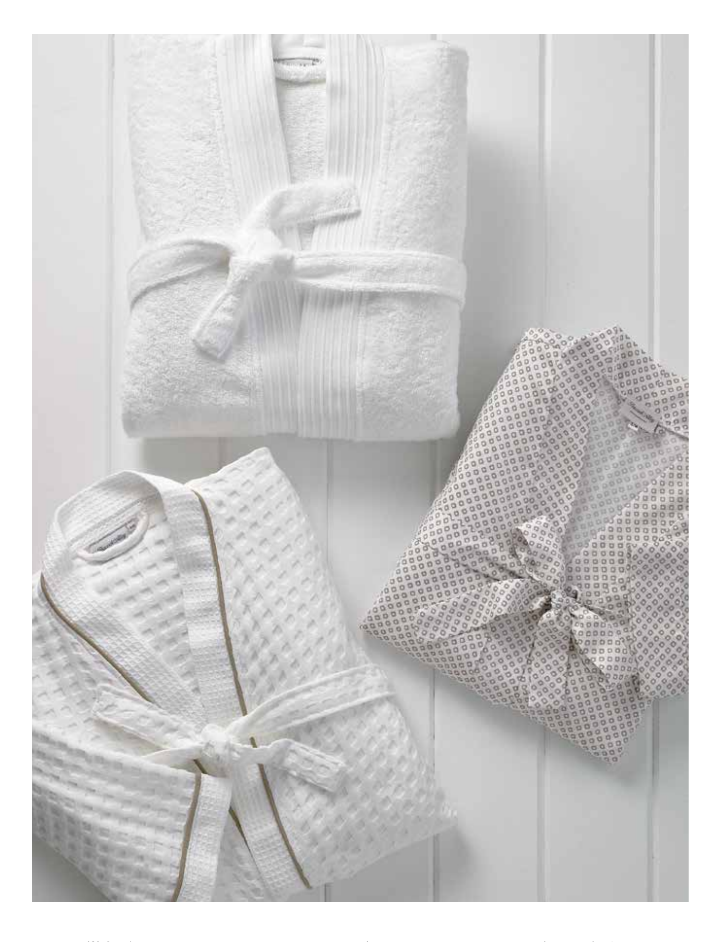
(Clockwise) BAMBOO ROBE White. 60% rayon from bamboo/40%cotton. Portugal. Robe BBR-R SM/MED or L/XL $145. EMMA ROBE Linen-color. 100% Egyptian cotton. Made in the USA from Portuguese fabric. Robe EMM-R SM/MED or L/XL $145-$160. WAFFLE ROBE White with Linen-color trim. 100% cotton. Portugal. Robe WAF-R SM/MED or L/XL $135. See peacockalley.com for more