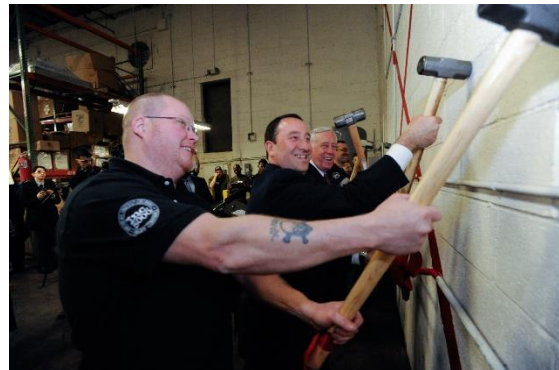
Everyone joins in on tearing down the wall; Marlin Steel's factory is expanded by 53%.