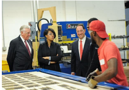
Mayor Rawlings-Blake and Congressman Steny Hoyer see manufacturing in action!