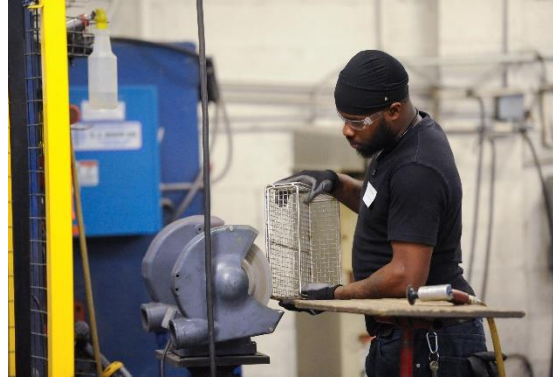
A Marlin Steel employee hard at work creating a custom wire basket for a client.