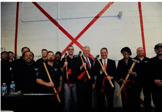
Accompanied by the Marlin Steel team, the wall gets prepared to be taken down.