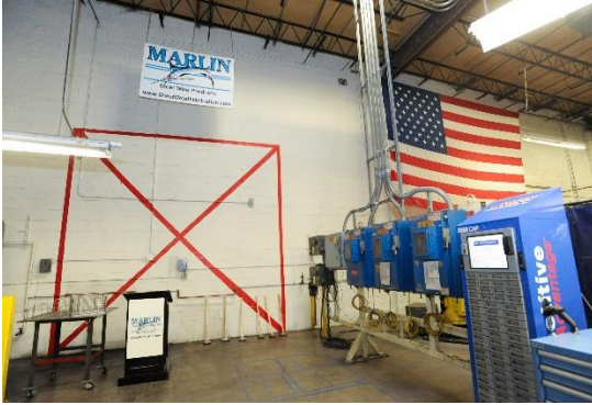
X marks the spot for where the wall will be torn down at the Marlin Steel factory.