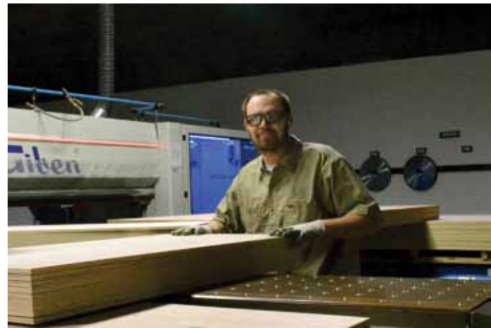
UFP expanded its Ranson wood processing operation into Burr Business Park.

An unused portion of the property was later leased to UFP-Ranson Universal Forest Products (UFP) for its expansion needs, which were discovered during a retention visit. Under a quick deadline, JCDA helped UFP locate the only existing industrial space in Jefferson County that allowed UFP to manufacture wood products for a major national retailer. UFP will provide significant revenue to the Jefferson County school system and create local jobs.