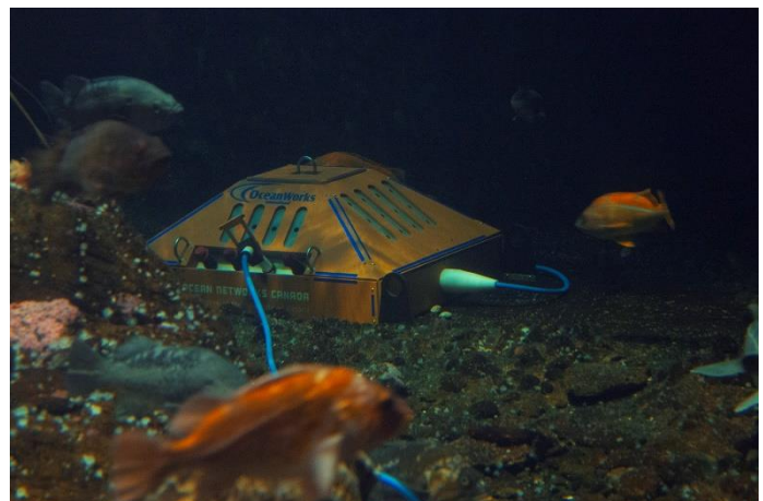
A representation of the OceanWorks Seafloor Node at rest in the Strait of Georgia Aquarium tank