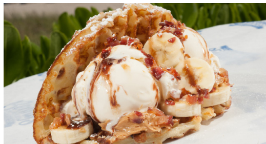
Meet The Elvis: Benny's Beach Bread filled with vanilla ice cream, peanut butter, banana and crumbled bacon. (Contributed)