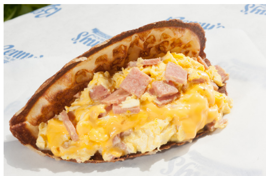
The Jersey Shore Beach Bread at Benny's on the Beach.