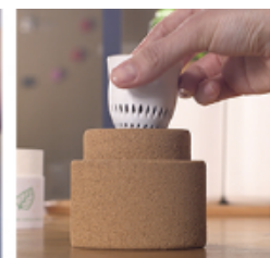
Insert your capsule