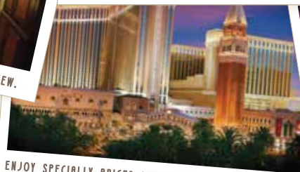
ENJOY SPECIALLY PRICED LUXURY ACCOMMODATIONS.