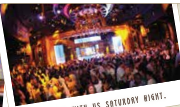
SHAKE IT OFF WITH US SATURDAY NIGHT.