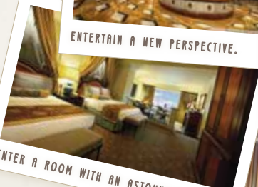
ENTER A ROOM WITH AN ASTOUNDING VIEW.